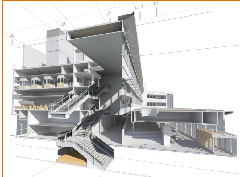
Figure 2: Section View of Lobby and Atrium

This alternative will require significant assessment to see if it is feasible, as there is no basement in the STEM Center and this analysis will be from the ground up. For coordination with the building's existing mechanical system and equipment as a whole, it is noted that radiant heating is provided using hot water carried in flexible PEX tubing. The source for hot water in radiant flooring is typically a gas-fired boiler, just like the existing boilers the STEM Center already employs. Therefore a significant change in equipment should not be necessary, although resizing will potentially be needed to ensure accurate and efficient heating supply for such an alternative system.