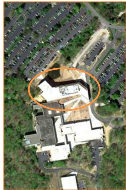
Figure 1: Site Plan Aerial View

Overall, limiting factors on the STEM Center design were minimal. With the site being on the DCCC Marple Campus, in the greater Philadelphia area, it was obvious that there would be a slightly higher emphasis on heating than cooling, but a need for good balance and control altogether. The building design and architecture itself, containing a sizeable glass façade on south side at all four levels, suggested a concern for high amount of solar gain as well. The orientation of the building is suitable though, as the majority of the glazing won't receive the significant glare they might if facing east or west.